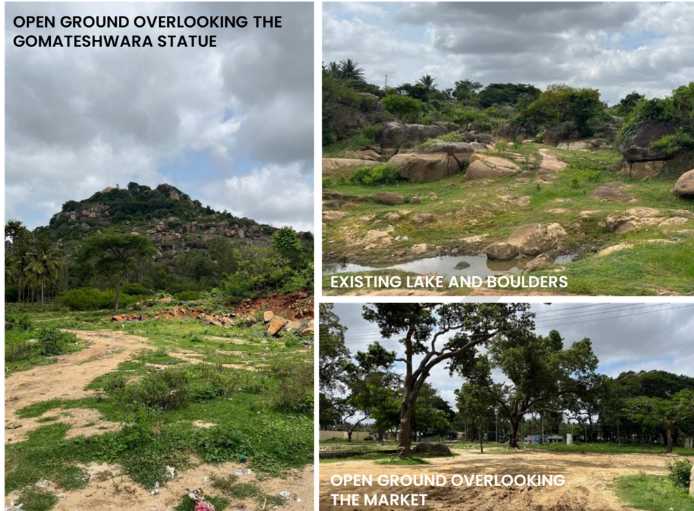
Fig: Site Pictures